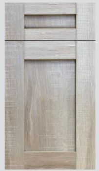
Genesis Sliced Oak