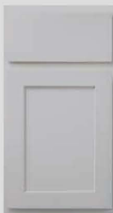
GRANTLEY Pewter Paint