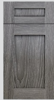
Genesis Weathered Oak