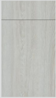
Artisan White Oak