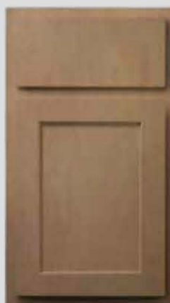
GRANTLEY Sandalwood Stain Birch