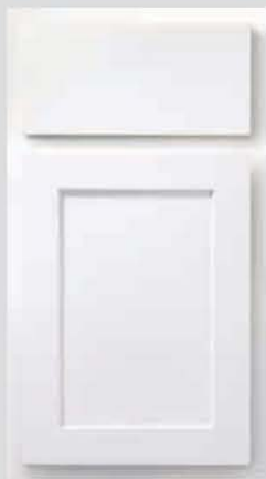
GRANTLEY White Paint